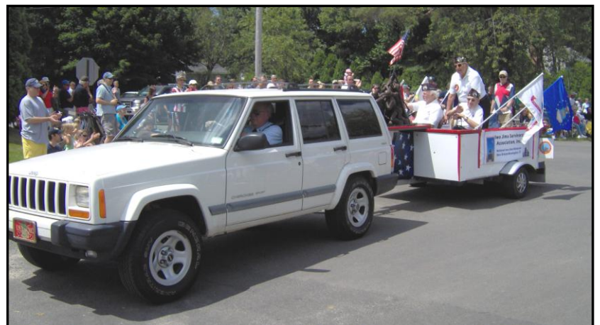
Survivors wave to the parade watchers along the route.