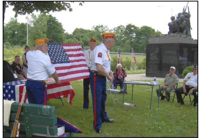
Hardware City Detachment Marine Corps league present the Forever Wave demonstration.