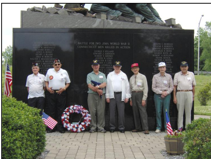
Survivors attend the Open House activities

The day was enjoyed by everyone who visited and the Survivors look forward to sponsoring another Open House next year with many more activities.